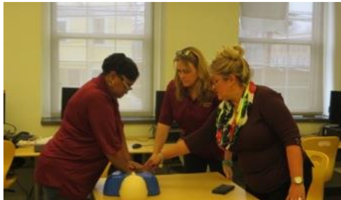
Pictured: Staff celebrate heart health month (far left). Lincoln's Code-Blue members get recertified in CPR (left).