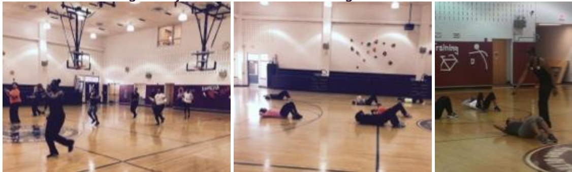
Pictured: Lincoln's Fit Camp.