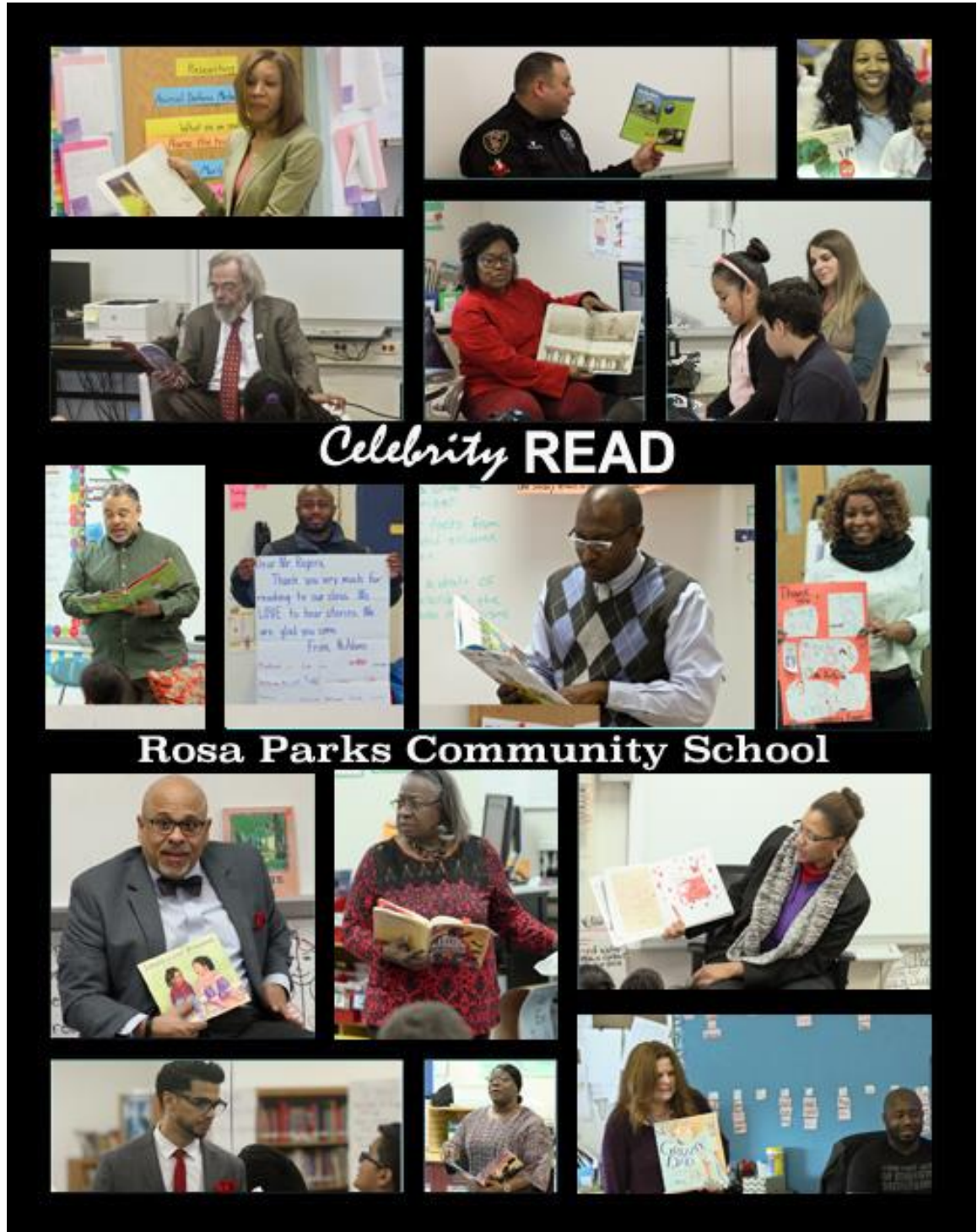
Pictured: Photo montage of Rosa Parks Community School's Celebrity Read.