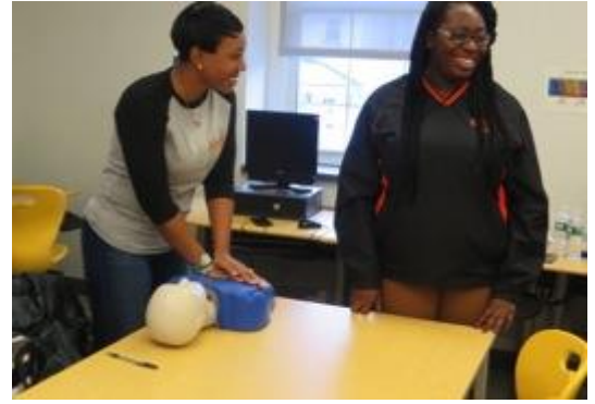
Pictured: Additional Lincoln Code-Blue members get recertified in CPR.