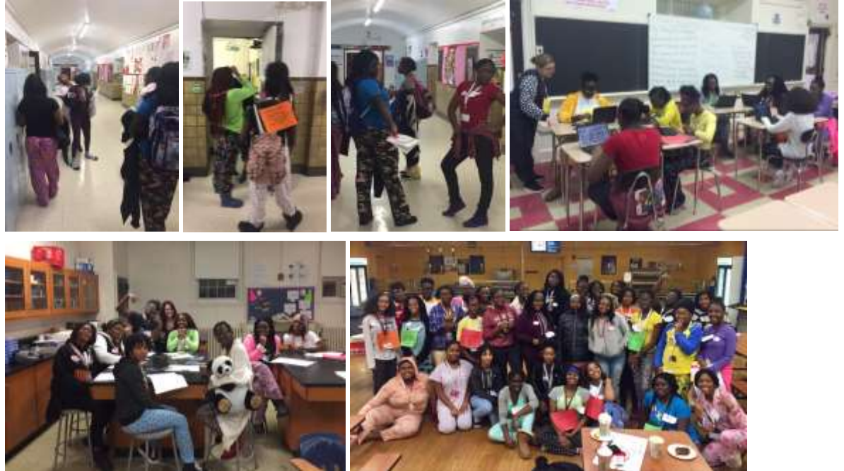
Pictured: Additional scenes from a "Girls Night In" at Orange Prep Academy.