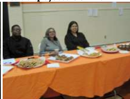
Pictured: Graphics Design and Culinary Arts displays at CTE Fair.