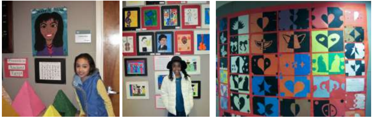
Pictured (above and right): LAS students with their work and additional LAS artwork.