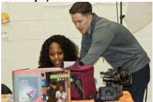
Pictured: Accounting and Digital Media displays at the CTE Fair.