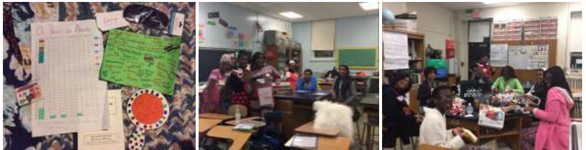
Pictured: Scenes from a “Girls Night In” at Orange Prep Academy.