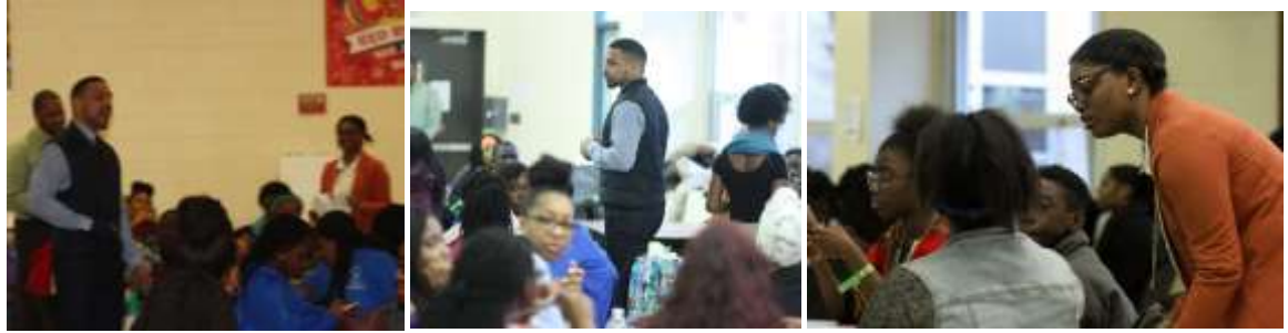
Pictured: Scenes from Amplifying Youth Voices.