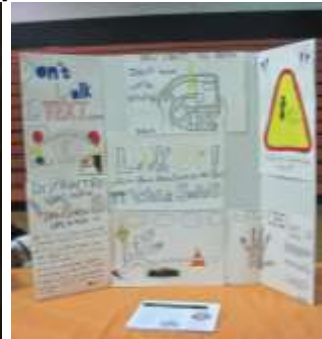
Pictured: Health Sciences/HOSA displays at the CTE Fair.