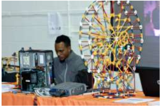
Pictured: STEM display at the CTE Fair.