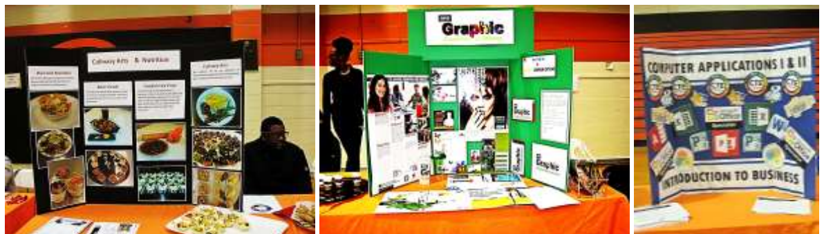
Pictured: Course displays at the CTE Fair including Business, Accounting, Culinary Arts, Graphics and Computer Applications.