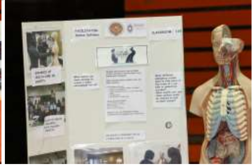
Pictured: Health Sciences display at the CTE Fair.