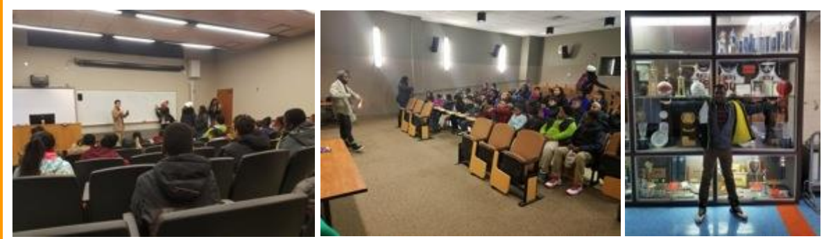
Pictured: Scenes from OACS's Lincoln University visit.

This February, the students at Oakwood Avenue learned about several HBCU's and their "roots in the past, while also building the future." They learned that most African Americans were not allowed to attend school until after the Civil War. On February 16, a group of OACS students were delighted with a personal tour of the first HBCU, Lincoln University. The students were able to see the different lecture halls, the student center, and they even had the opportunity to receive a mini lecture by one of the Biology Professors!