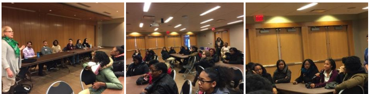
Pictured: Orange Prep Academy students at Drew University.

To end the visit, students arrived to the Crawford Center for a panel discussion. The panelists consisted of Admissions Counselor, Financial Aid Counselor, Student Life representatives, EOS staff, students and two Drew Professors. The panelists introduced themselves and provided useful advice, financial aid information and career options. The Financial Aid Counselors offered data about the FAFSA and its qualifications. They mentioned the Merit money, federal work study, and EOS and EOF programs for NJ residents.