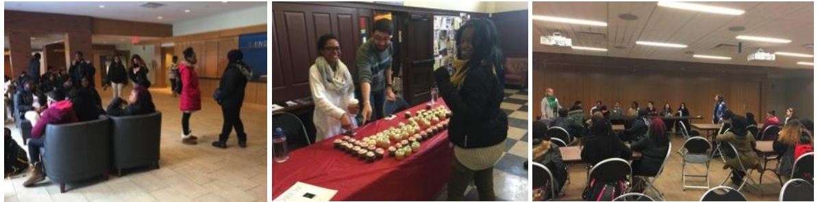
Pictured: Orange Prep students at Drew University.