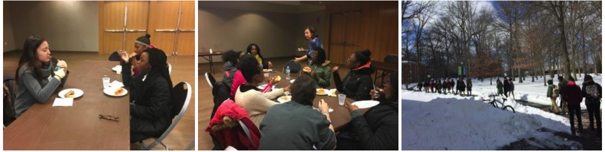
Pictured: Orange Prep Academy students at Drew University.