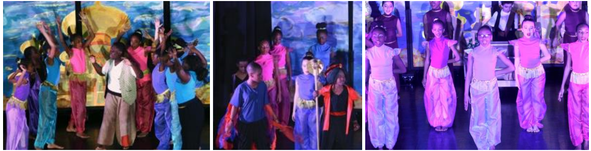
Pictured: Scenes from Disney's Aladdin Kids.

While one performance was eliminated from the schedule, due to the snowstorm that occurred days before, the Rosa Parks Community School's production of Disney's Aladdin Kids, on March 17 and 18, was outstanding. The lead actors and supporting cast members were well prepared to tell the tale of the lovable street urchin, Aladdin who wins the hand in marriage of princess Jasmine over the Royal Vizier, Jafar who plots to marry her with the help of the sly Genie. The tale based on "Arabian Nights" opens in the marketplace of Agrabah and is introduced by the Lamp Vendor. The student assistants complemented the fine acting, singing and dance performances, with the inventive scenery changes and adaptations that made the audience enjoy a magic carpet ride, along with Aladdin and princess Jasmine, as they sang one of the production's iconic tunes, "A Whole New World."