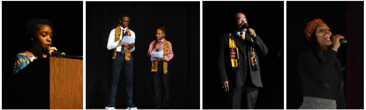
Pictured: Performers at Orange Prep's Black History Month Celebration.