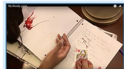
My Bloody Juliet