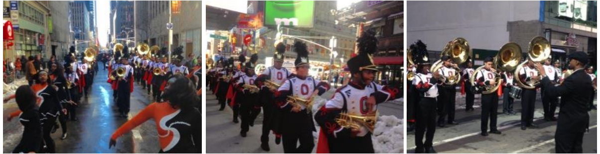
Pictured: The Might Marching Tornadoes at the St. Patrick's Day Parade.