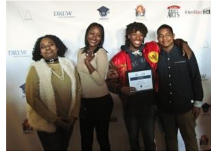
Pictured: OHS FilmBoot24 participants.

To view all of the films shown at the Red Carpet Screening, http://www.cinemaed.org/filmboot24-films .