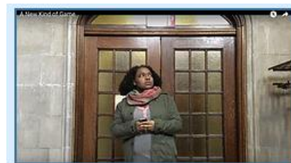
A New Kind of Game