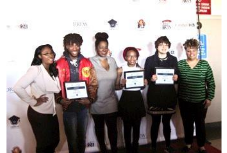
Pictured: FilmBoot24 participants.