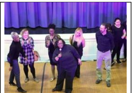
Pictured: Production team.