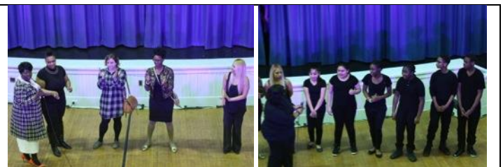
Pictured: Disney's Aladdin Kids team members.