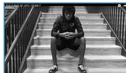
The Game of Life