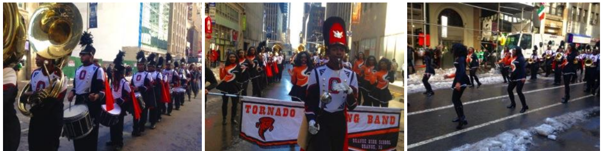
Pictured: The Might Marching Tornadoes at the St. Patrick's Day Parade.