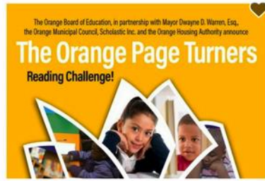
Orange Page Turner's Challenge

Let's show our support for the readers via the link below. The Orange Page Turners Go Fund Me page.