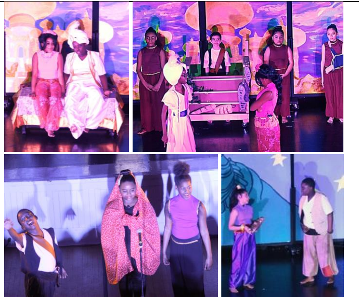
Pictured: Scenes from Disney's Aladdin Kids.