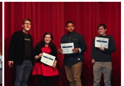
Pictured (left to right): FilmBoot24 Teams, A New Kind of Game , My Bloody Juliet and All In .