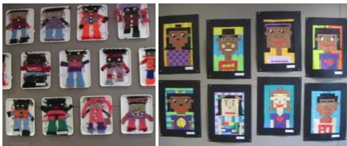
Pictured (above and right): Artwork by OACS students.