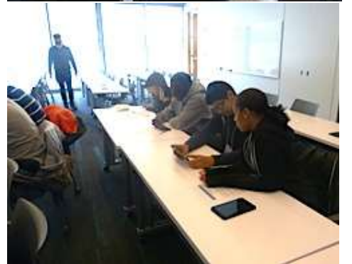
Pictured (above): Scenes from The Blacks at Microsoft (BAM) Minority Student Day Program.