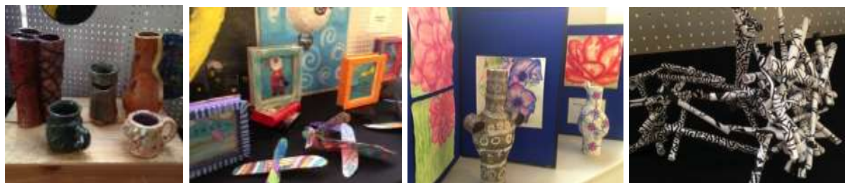
Pictured: Sample of work represented by the Orange Public School District at the PRIDE Expo.

The Essex County Education Association hosted its annual "Pride Expo" at the Livingston Mall from March 13 through March 20. The Expo involved the display of classroom projects, artwork and sculptures, as well as live performances and demonstrations by students from Essex County's public schools. Also featured was an awards ceremony for the PRIDE Essay contest winners on March 16.