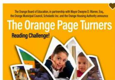
Orange Page Turner's Challenge

Register today at www.orange.k12.nj.us . Registration forms will also be available at the library and local and school events. Once you are registered you will receive a welcome email and the following link to log the number of pages you have read: Orange Page Turners' Reading Challenge Tracker