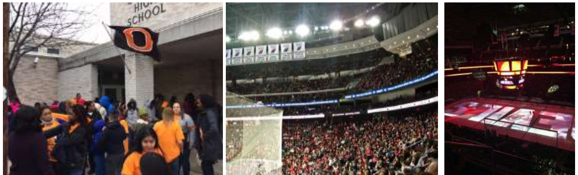
Pictured (left to right): Students gather at Orange High School for a trip to the Devils gamea packed Prudential center; Devils hockey rink.