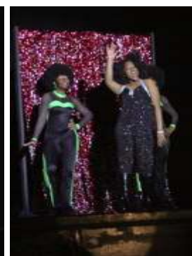
Pictured: Scenes from Sister Act.