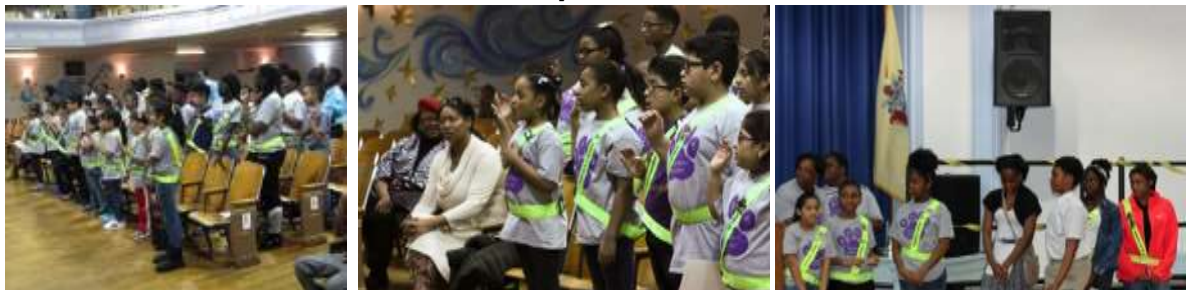
Pictured: Scenes from RPCS Safety Event.