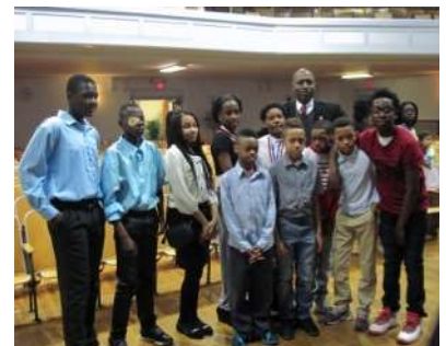
Pictured (life to right): RPCS Safety Patrol; Park Avenue Safety Patrol; OACS Safety Patrol.