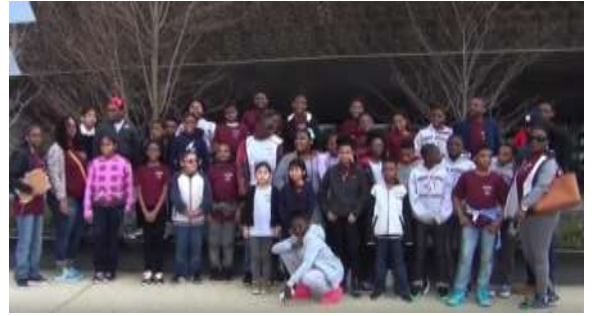
Pictured: Park Avenue Students at the National Museum of African American History and Culture.

On March 1, Park Avenue students had the amazing opportunity to visit the National Museum of African American History and Culture. Forty students in grades 4-7, were selected to make this trip because they have been participating in the Twenty-First Century After School program. The students had a wonderful time in the museum, which contains over 36,000 artifacts, focusing solely on African American history and culture. Here's what they had to say: