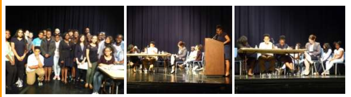
Pictured: Mock Trial at Orange Prep Academy.

On May 5, Orange Preparatory Academy was again a participant in the annual Essex Vicinage Law Day Program's mock trial. The theme for this year's trial was "The 14th Amendment: Transforming American Democracy." The theme provided an opportunity for students to study the various ways that the Fourteenth Amendment has reshaped American law and society. The participants, Grade 8 students, were given a fact pattern and witness statements in advance of the trial. They then prepared opening statements, direct and cross examination of each of the witnesses, and closing remarks.