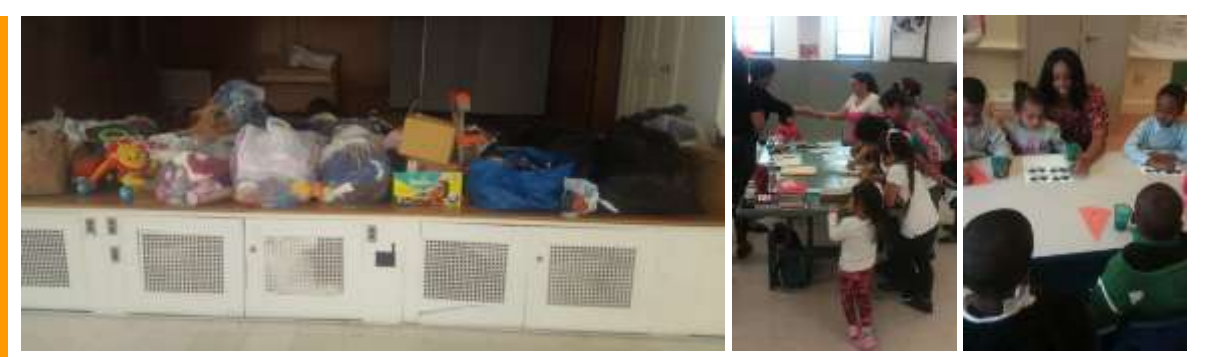
Pictured: Scenes from FAME at Scholars Academy.