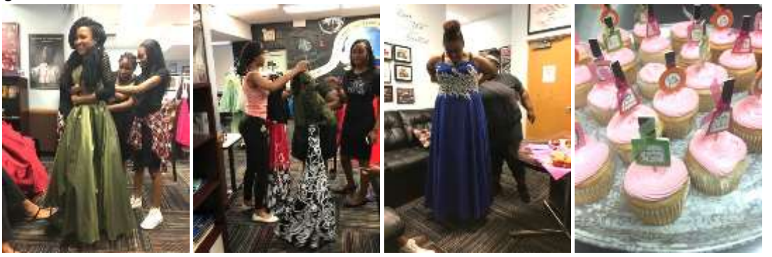
Pictured: Students selecting dresses at Project Prom.

Prom is right around the corner, on May 25, and Orange High School students are so excited! In order to assist those interested with their prom expenses, the Ladies In Training (LIT) girls group collaborated with SPACE (OHS school based counseling program from Family Connections) to give away prom dresses to attendees. The event was called Project Prom and was held on April 11 and April 13. Over 45 students visited the "LIT closet" to try on and gowns.