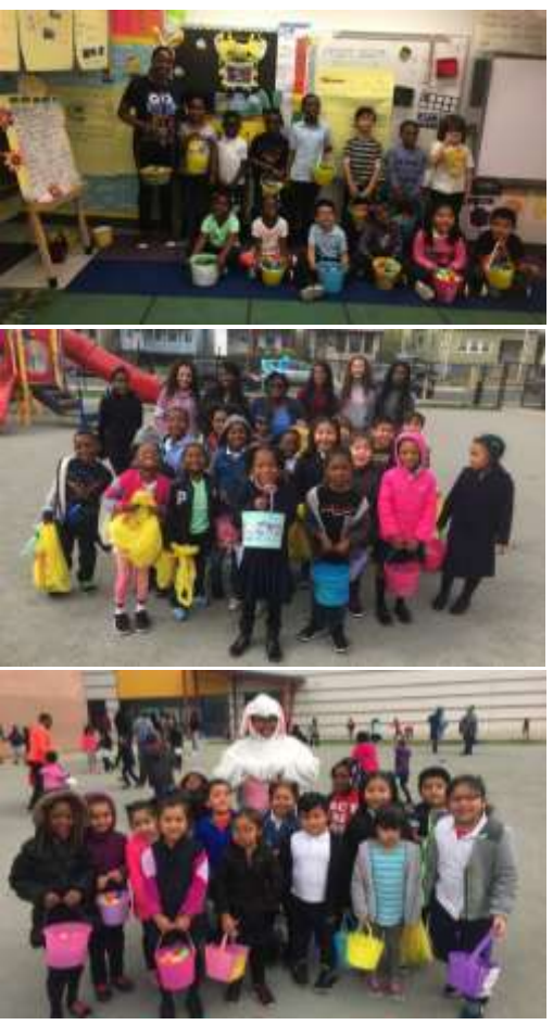
Pictured (above and left): The Easter Rabbit's visit to Lincoln Avenue School.