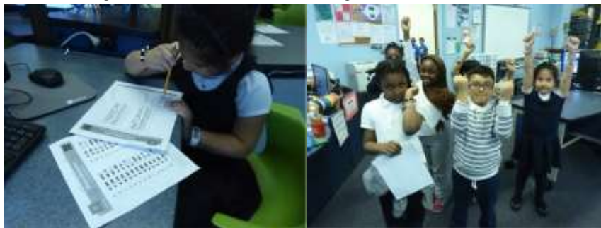
Pictured: Scenes from Scholars Academy's Code.org activities.

First and Second graders continued with Code.org course 2 and during the week of May 8, learned about Bits and Bytes making their own Binary Bracelets with pipe cleaners and black and white beads. Students learned about on and off (1 and 0 on a computer) and how computers store all sorts of information in binary form. They learned to encode letters into binary form and decode it back to letters. After that they used black and white beads (for off and on) to store their initials on a bracelet. They also used the same Binary Decoder Key from the bracelets to decode a message, which said, "Code Is Fun". This was an "unplugged" lesson, which is on paper, although most of the lessons are online. They each have accounts to keep track of their progress. They have also learned about programming, algorithms, loops, debugging, and conditional statements in coding. They are having a great time while learning valuable math and coding skills.