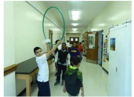
Pictured (above and left): Scenes from Scholars Academy's week in STEM activities.

First and Second graders continued with Code.org course 2 and during the week of May 8, learned about Bits and Bytes making their own Binary Bracelets with pipe cleaners and black and white beads. Students learned about on and off (1 and 0 on a computer) and how computers store all sorts of information in binary form. They learned to encode letters into binary form and decode it back to letters. After that they used black and white beads (for off and on) to store their initials on a bracelet. They also used the same Binary Decoder Key from the bracelets to decode a message, which said, "Code Is Fun". This was an "unplugged" lesson, which is on paper, although most of the lessons are online. They each have accounts to keep track of their progress. They have also learned about programming, algorithms, loops, debugging, and conditional statements in coding. They are having a great time while learning valuable math and coding skills.