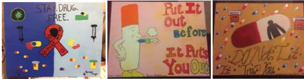
Pictured: Second Annual Conference on Drugs and Alcohol student campaign posters.