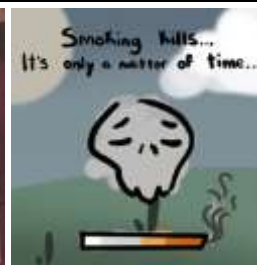
Pictured (left to right): Scene from Second Annual Conference on Drugs and Alcohol; Student campaign posters.