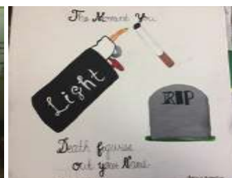
Pictured: Second Annual Conference on Drugs and Alcohol student campaign posters.