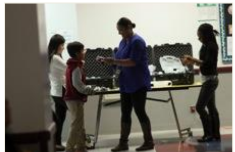
Pictured above: Scenes from RPCS's Back to School Night.