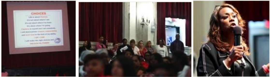
Pictured above: Scenes from Orange Prep's Back-to-School-Night.