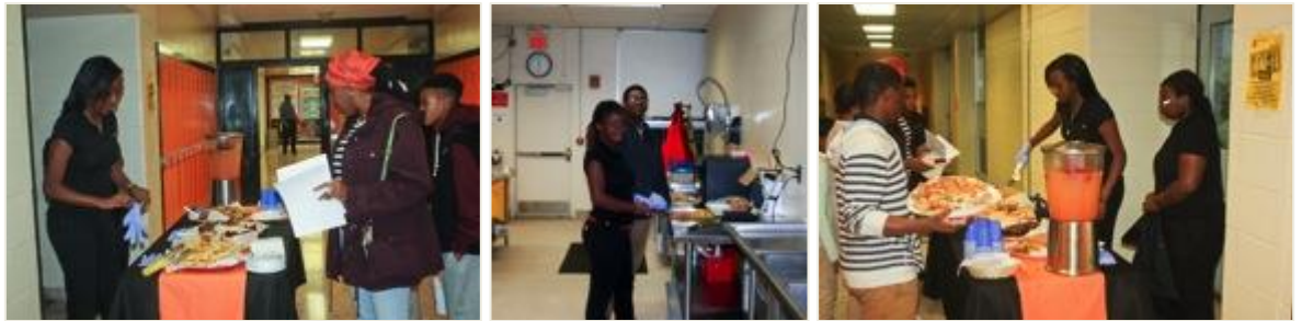
Pictured: Culinary Club students serve parents during Back to School Night.