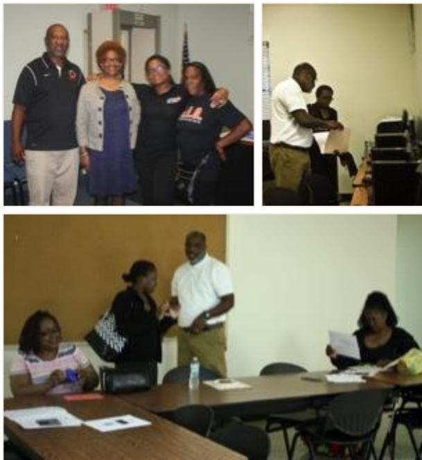
Pictured: Scenes from CIAO's Back-to-School-Night.