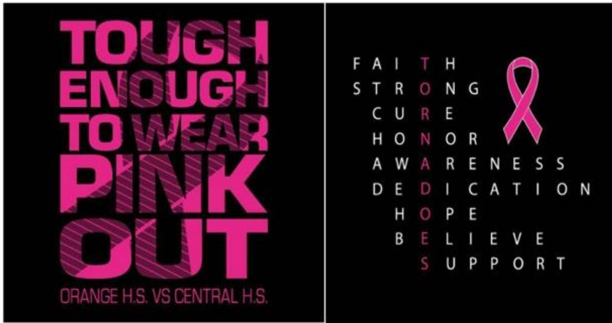
Front of T-shirt

(All proceeds/donations will be donated to the American Cancer Society October 28 th at the game).