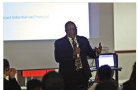
Pictured (above and left): Scenes from RPCS's Back to School Night.