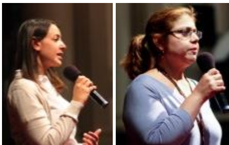
Pictured above: Scenes from Orange Prep's Back-to-School-Night.

Back-to-School Night at Orange Preparatory Academy, one of the district's three community schools, was held on September 27. The school welcomed returning and new Grade 8 and 9 families. The welcome began in the school's lobby where parents and students picked up class schedules and various information packages, including information about the district's Parent Academy the school's PTSO and more. Student ambassadors assisted teachers, along with Montclair State University staff, supporting Orange Prep's community school model.