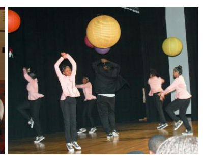
Pictured: Scenes from Teen Summit 2016.